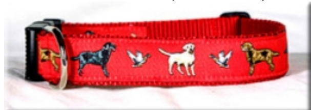
Labrador Retriever (Red or Yellow)