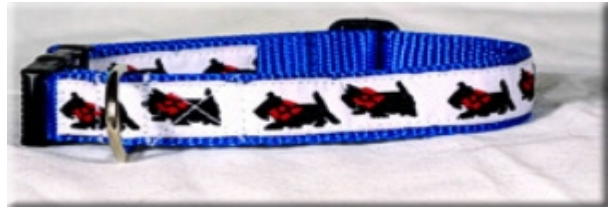
Scottish Terrier (White)