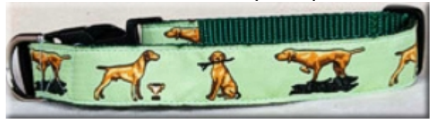
Vizsla (Blue or Green)