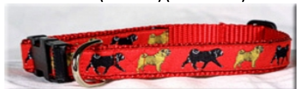
Pug (Red or Yellow)