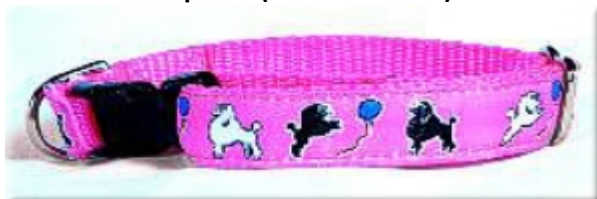
Poodle (Toy/Miniature) (Pink or Blue)