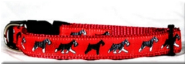
Schnauzer (Red or Yellow)