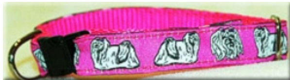
Maltese (Pink or Blue)