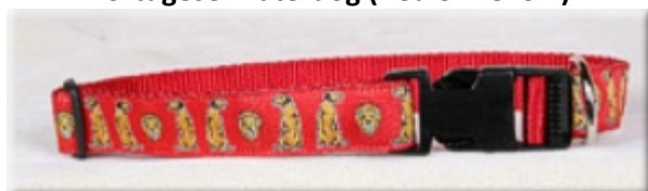
Rhodesian Ridgeback (Green or Red)