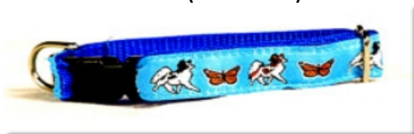
Papillon (Blue or Yellow)