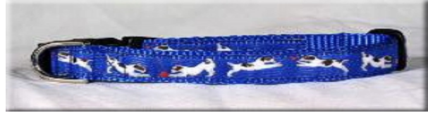
Jack Russell Terrier (Red or Yellow)