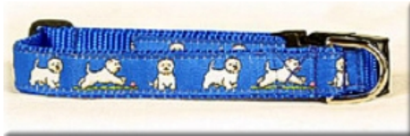
Westie (Red or Blue)