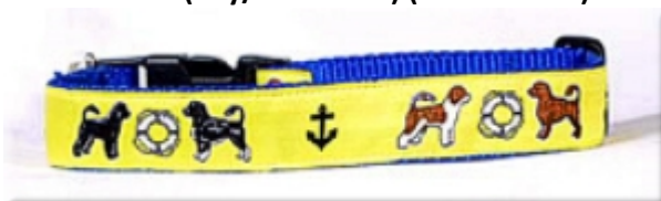
Portugese Waterdog (Red or Yellow)