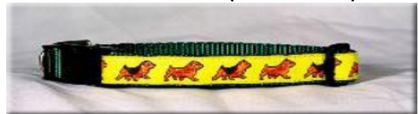
Norwich Terrier (Yellow)