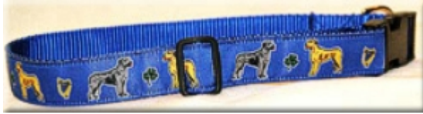
Irish Wolfhound (Green or Blue)