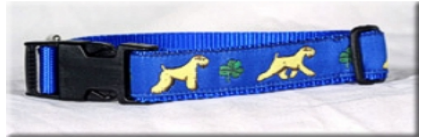
Wheaten (Blue or Green)