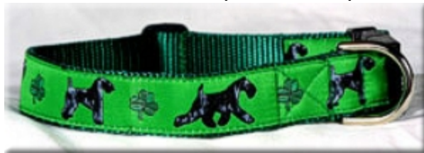
Kerry Blue Terrier (Green or Yellow)