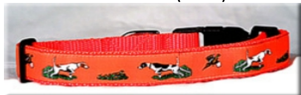
Pointer (Orange or Blue)