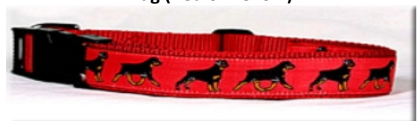
Rottweiler (Yellow or Red)